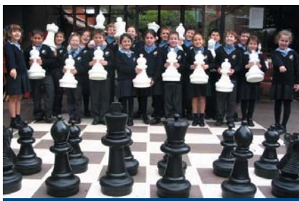
YEAR 2 STUDENTS AT GANDEL BESEN HOUSE HAVE FUN LEARNING CHESS ON THE GIANT OUTDOOR CHESS BOARD

Year 1 students will also experience chess this term, with Year 3 students having a go in Term 3. In addition, a master chess class runs at lunchtime for more skilled players.