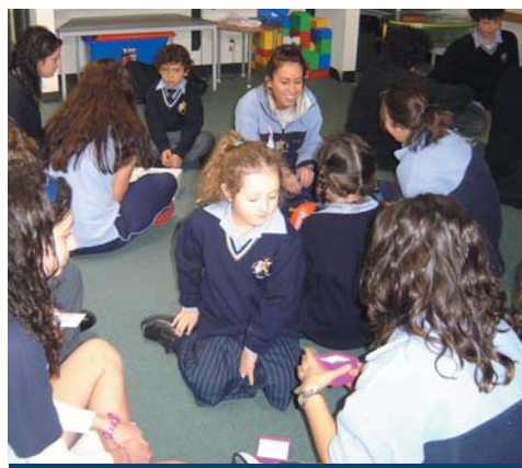
YEAR 11 STUDENTS GET TO KNOW THE PREPS AT FINK KARP IVANY

Where good learning is concerned, age has no boundary. Year 11 Psychology students recently enjoyed a morning with our Preps at Fink Karp Ivany Campus.