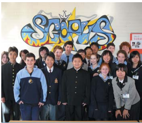
JAPANESE EXCHANGE STUDENTS AND THEIR SCOPUS HOSTS

If you haven't seen our alumni website, log on to our Old Collegians Online Communication Directory by going to www.scopus.vic.edu and following the prompts.