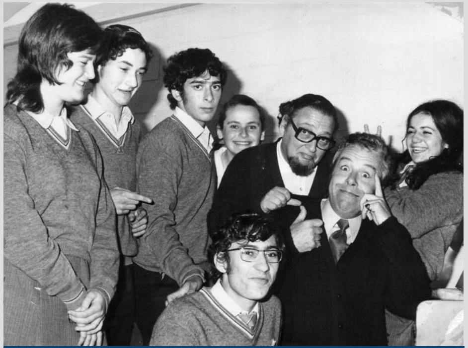
IS THIS YOU? CIRCA 1970